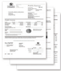
Bills and Statements