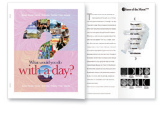
Colour Inserts, Staple and Engineering Z-Fold