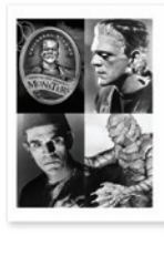
SquareFold Trim Booklet