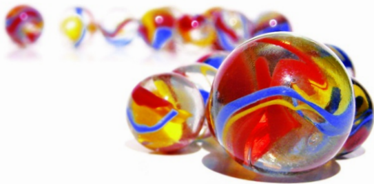
Solid ink colour is stunning. Images jump off the page!