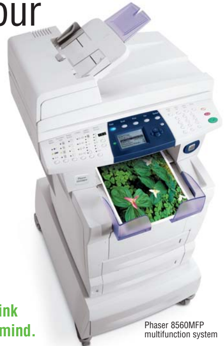
Phaser 8560MFP multifunction system

The Xerox solid ink imaging process is the most environmentally friendly way to put an image on paper. From its nearly waste-free printing process to its safe, toxin-free solid ink sticks, it was made with the earth in mind.