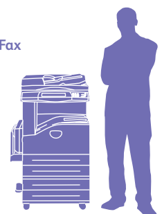
WorkCentre 5230 with two-tray module