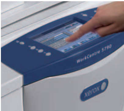
Personalised solutions you access right from the touch screen interface.

ScanFlowStore software by Nuance® greatly reduces document processing time with its powerful Optical Character Recognition technology. Using template-based scanning, a user simply selects specific “zones” on a document from which data specific to industries such as healthcare, legal or financial, is captured and used for file naming, creating network folders, populating PDF properties, searching and retrieving, and routing scanned documents to their correct repositories.