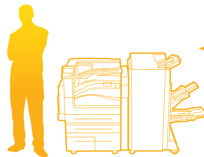
Phaser 7800 with Professional Finisher (requires installation of either a 3 Tray Module or High Capacity Tandem Tray)

For more information, visit us at www.xerox.com/office