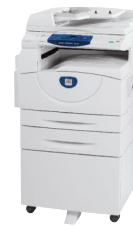
WorkCentre 5020 shown with Duplex Automatic Document Feeder, optional Tray 2 and Stand

UL – 60950 – 1 / CSA – 60950 – 1 – 03, CE Mark applicable to Directives 2006 / 95 / EC, 2004 / 108 / EC, 1999 / 5 / EC